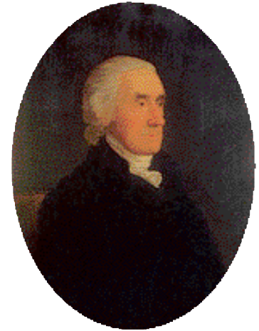
Robert Treat Paine Prosecution Lawyer