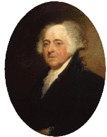
John Adams Defense Lawyer